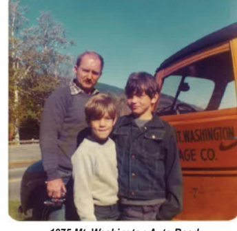
1975 Mt. Washington Auto Road with my dad and brother

County resident for the second half. Watching my children today is a continuous déjà vu moment of my own childhood romping through the Granite State's various attractions and activities.