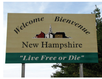
The Route 16 Corridor is one of the most traveled highways for people visiting the granite state. Together, we are strategically positioned to reach this affluent audience with an